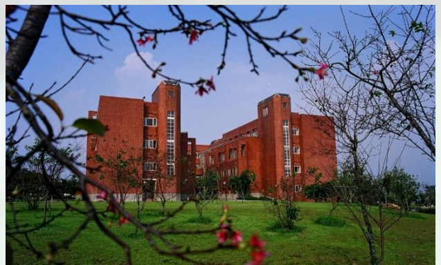
College of Science & Technology