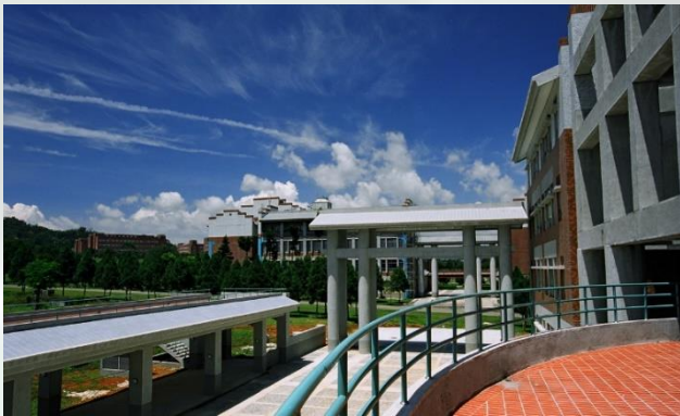
College of Education & Humanities