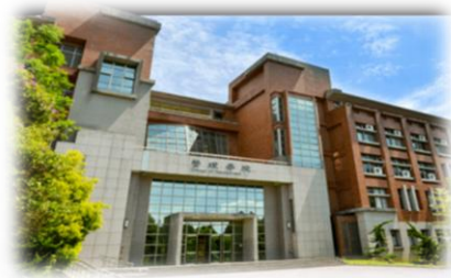
College of Management