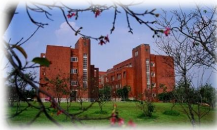
College of Science & Technology