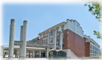
College of Humanities