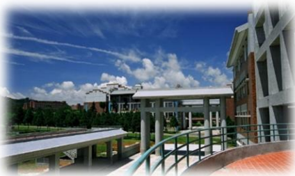
College of Education